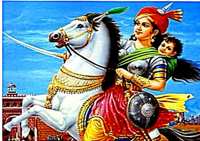
Khub Ladi Mardani –Jhansi wali Rani

Society will develop only when there should be no shortage in the education of girls, because women will provide a new direction to the society along with boys in the coming time. If any man is educated then he will be able to develop only himself, if a woman gets the right education then she has the power to change the whole society along with her. History is witness that Indian women have walked shoulder to shoulder with men and have also fought with them to free their society and country from the British. Rani Laxmi Bai of Jhansi who faced the British in the revolt of 1857. At the age of 29, he fought with the British Army. He did not bow down in front of the British, but got Veergati while fighting with valor.